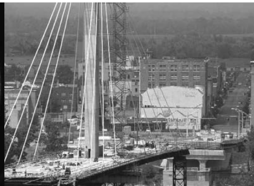
Two views of the new U.S. Grant bridge now under construction... and a new church at Gallia and Offner