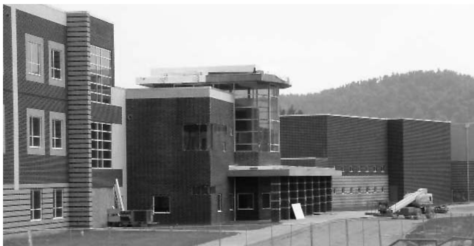
The New Grant School...