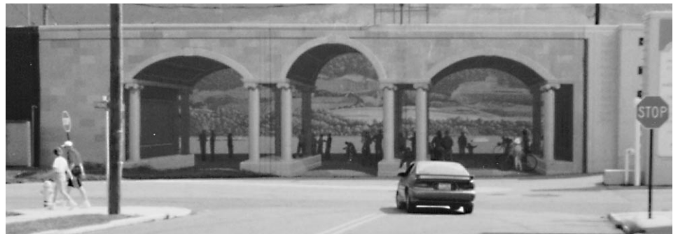
A fabulous illusion at the foot of Court and Front Streets. One of the best murals in my opinion.