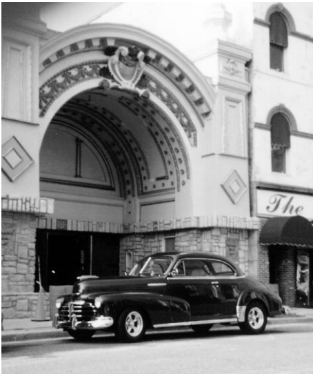
Columbia theater being renovated.

I have purposely tried to hold down the text matter in this issue in order to show as many hometown and alumni pictures as possible. Frank Hunter