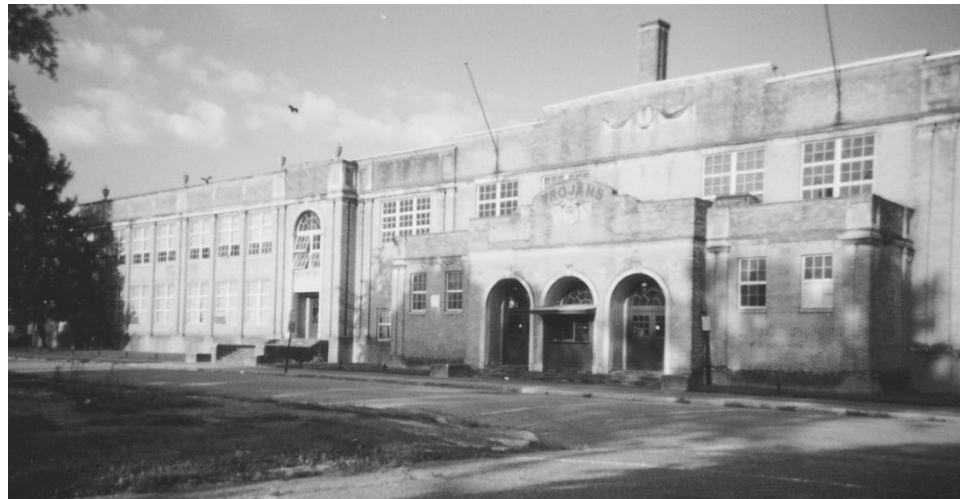
Looking South West towards the soon-not-to-be Grant School. Site of new Middle School.