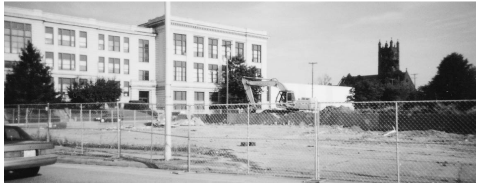
Looking West on Gallia towards the High School. Site of new High School Campus.