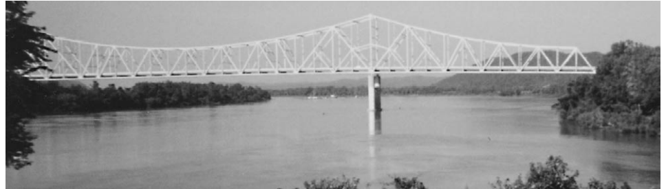
The new bridge which replaced the U.S. Grant at the confluence of the Scioto and Ohio